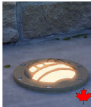
Brass In-ground With Grate